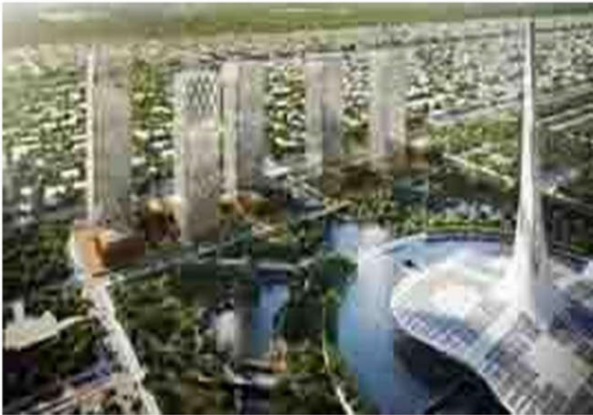
An artist's impression of the proposed five towers designed by the APCRDA at Palavagu in Amaravati.

Prime Minister Narendra Modi will relaunch the works on construction of the capital city